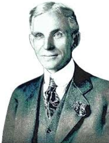
Figure: Ford W. Harris 2 , an American production engineer, proposed the EOQ model in 1913